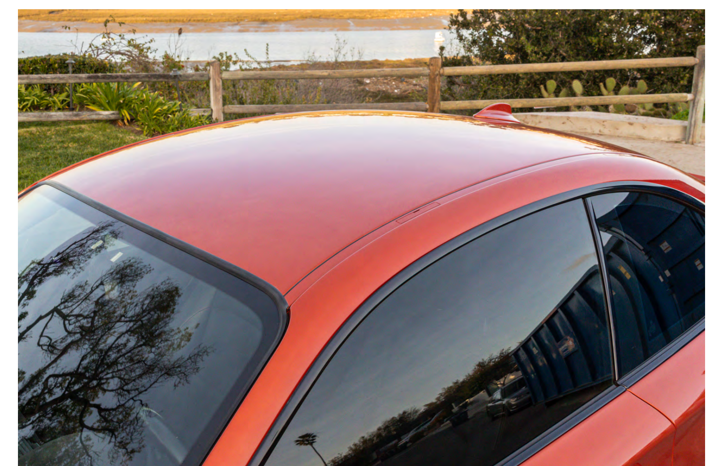
Roof and hood