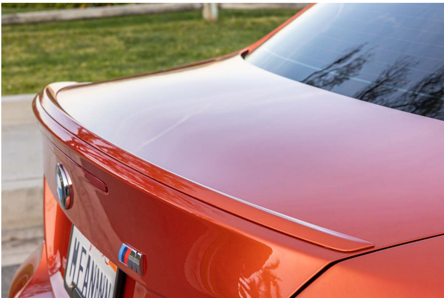
Wing, diffusers, or front lip