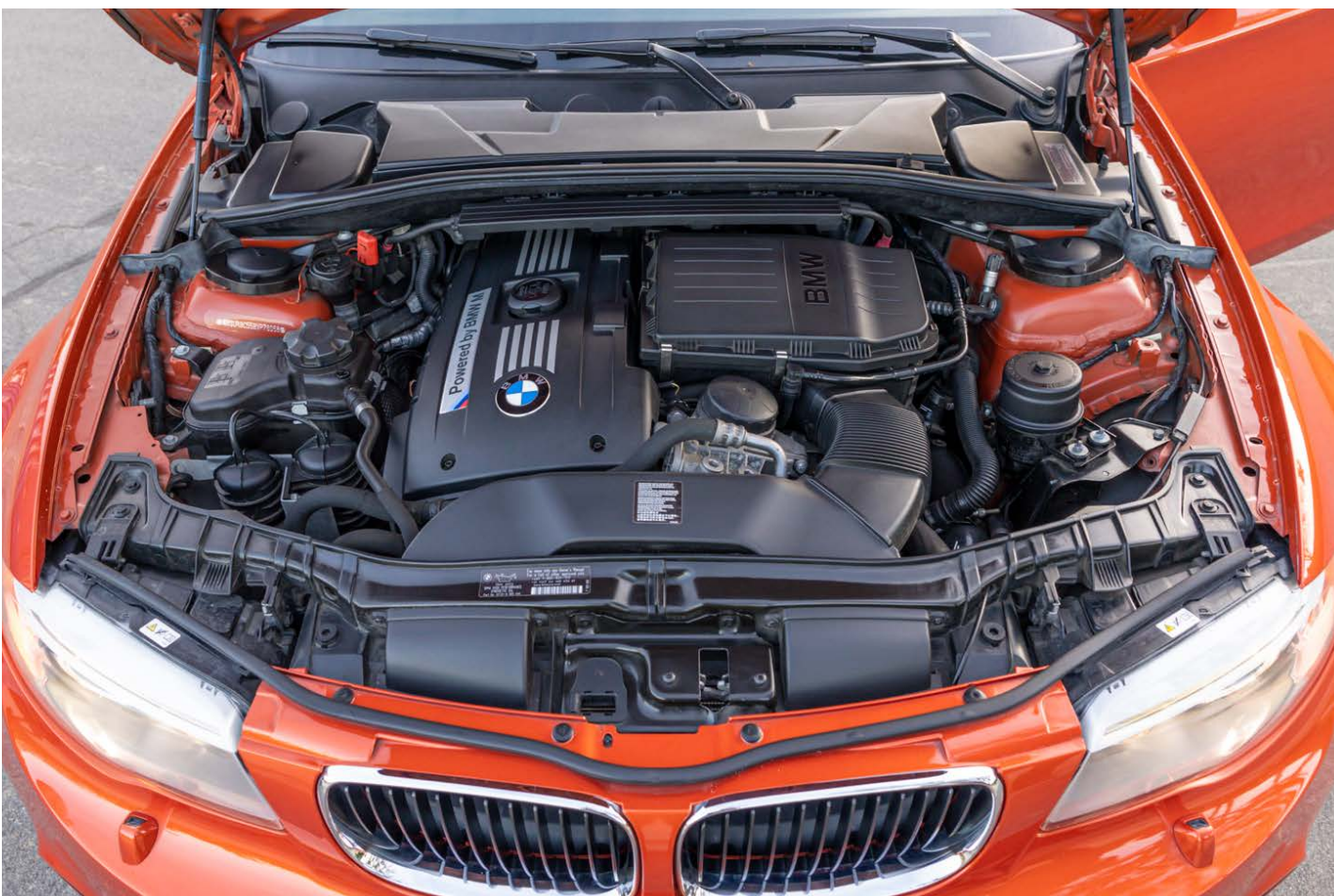
Entire engine bay from above

Clean the engine bay and gather records.