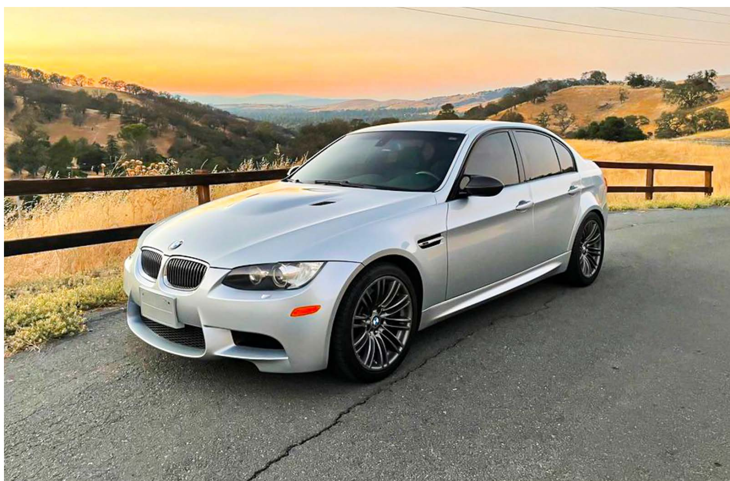
Best to shoot 2 hours before sunset

Proper lighting reduces sun glare and harsh shadows.