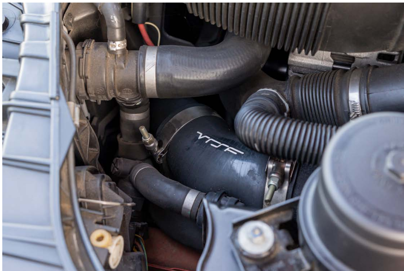
Close-up of modifications