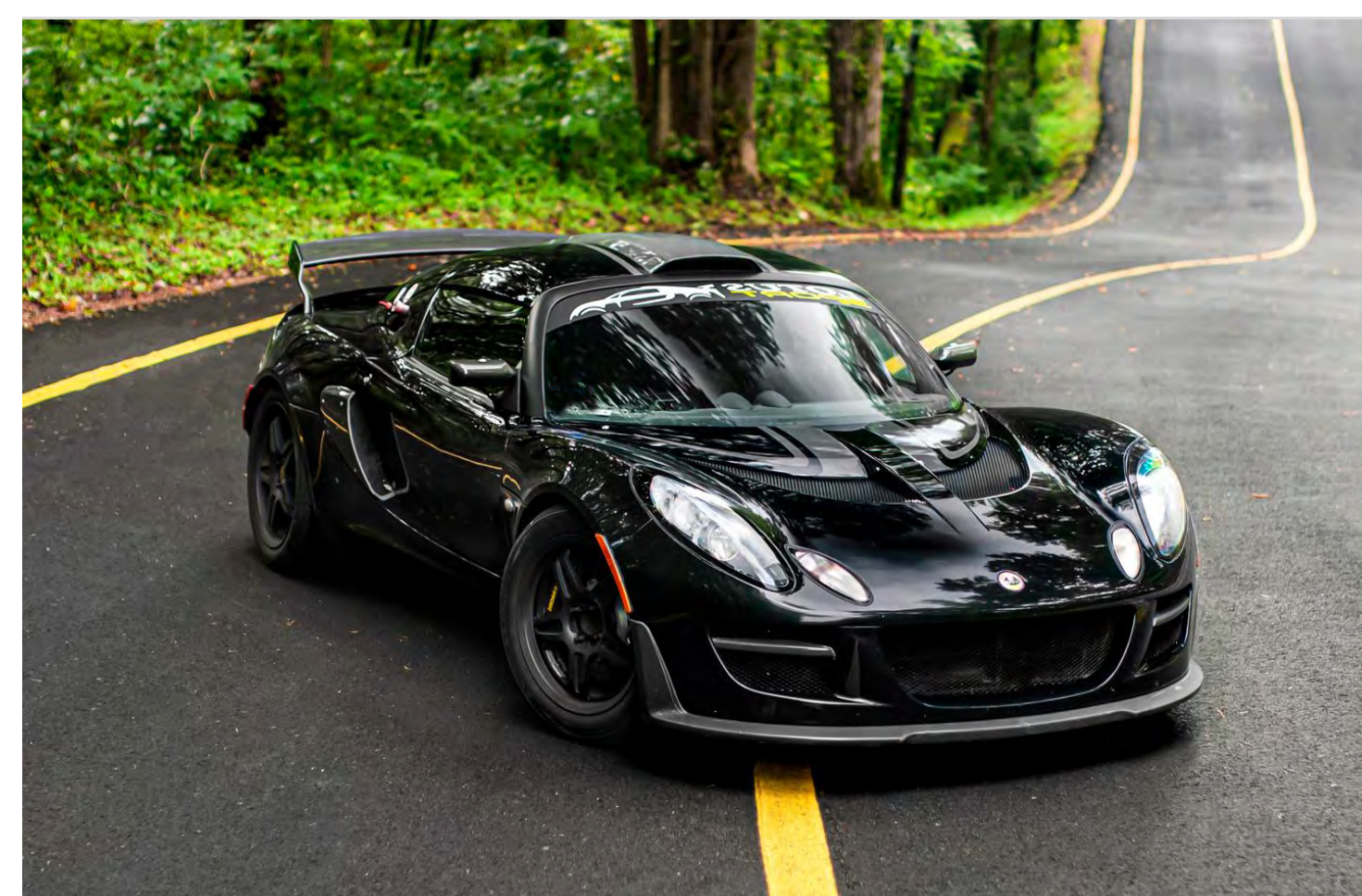
Backroad or nature area

An uncluttered background without other cars or people.