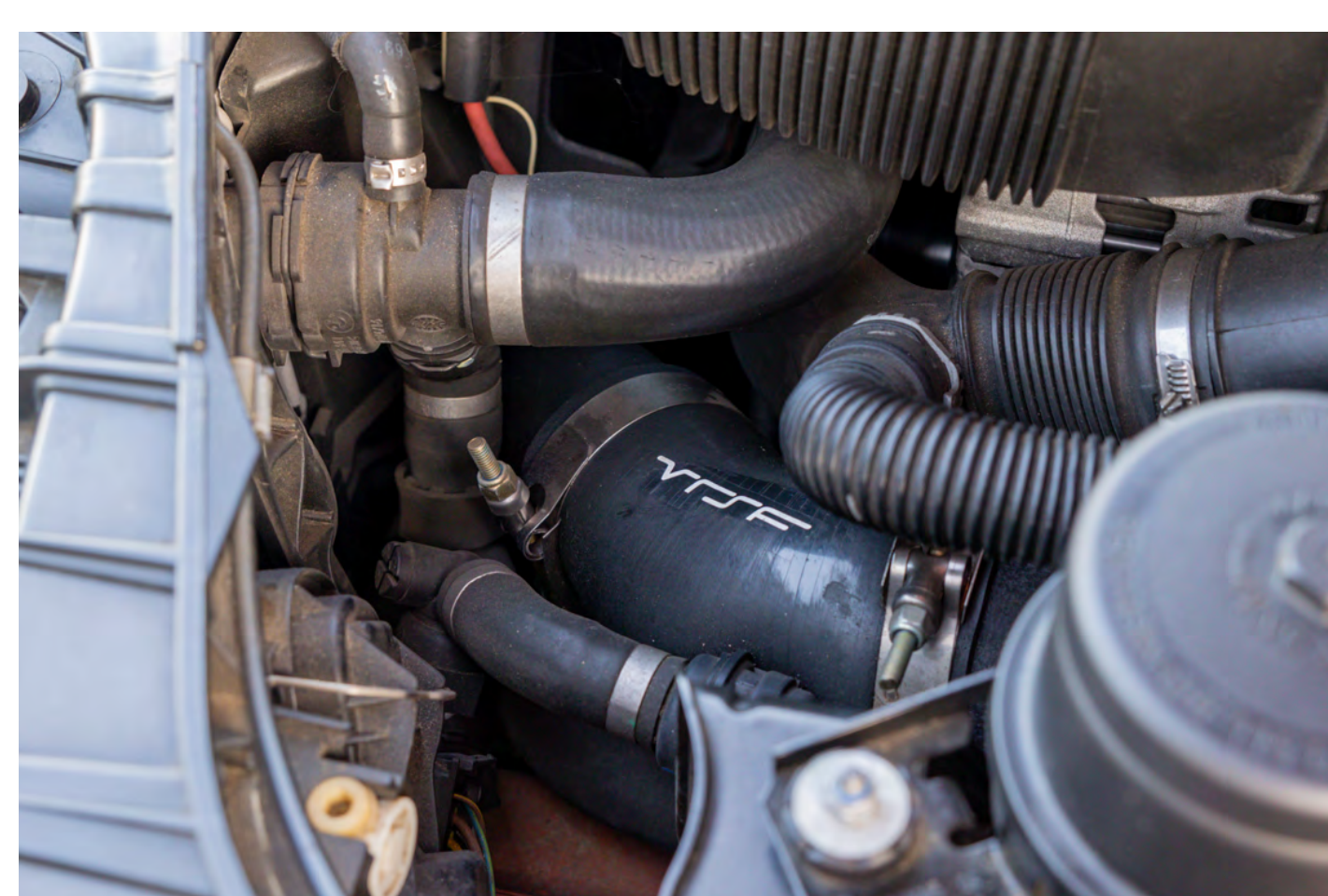
Close-up of modifications