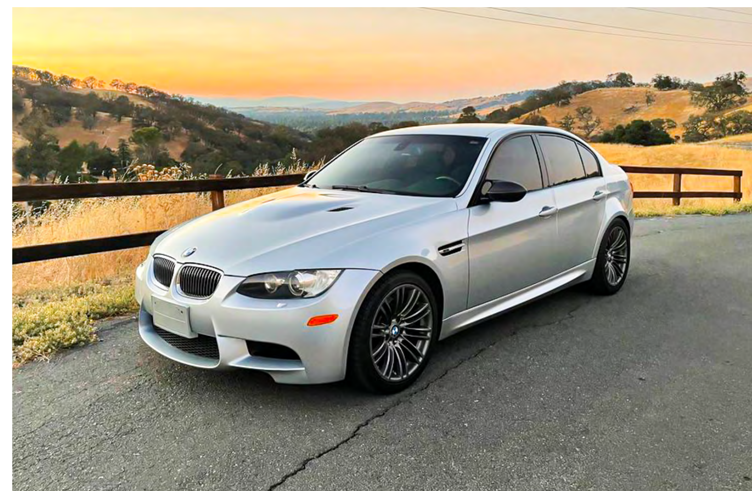
Best to shoot 2 hours before sunset

Proper lighting reduces sun glare and harsh shadows.