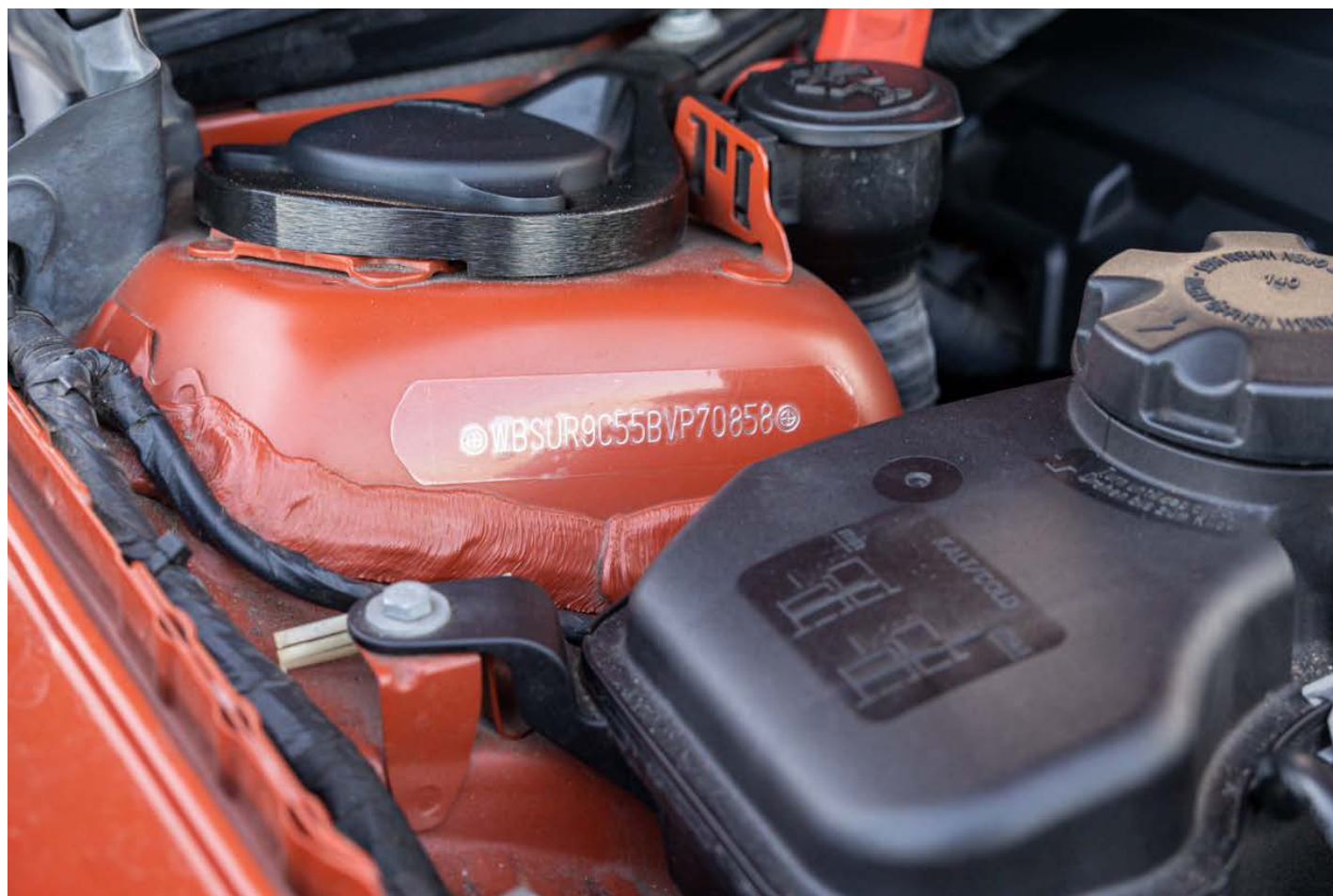
VIN, stamps, or markings