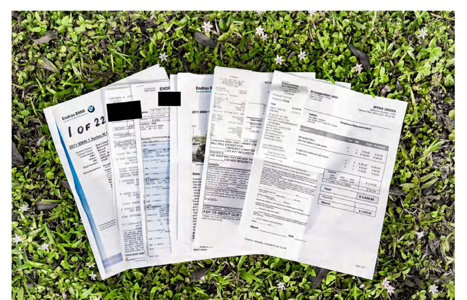
Service records or dyno charts