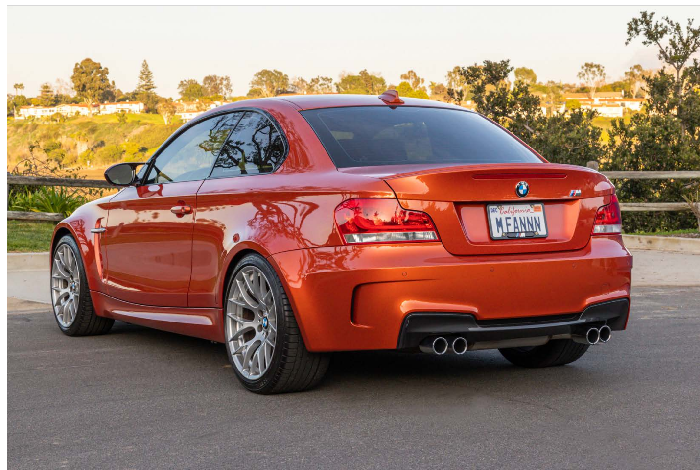
Driver rear quarter