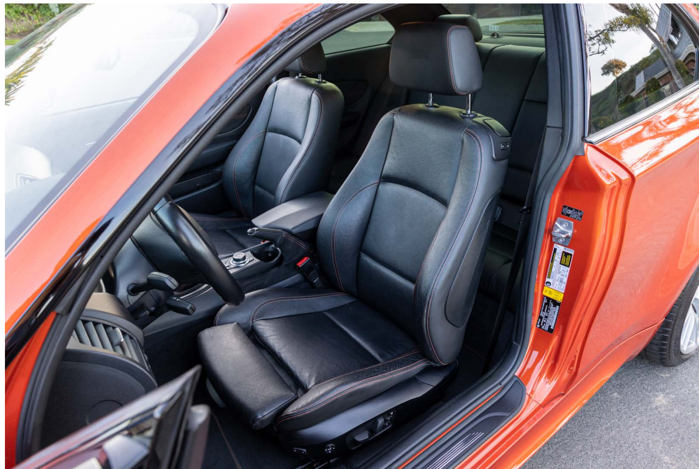
Front driver and passenger seats