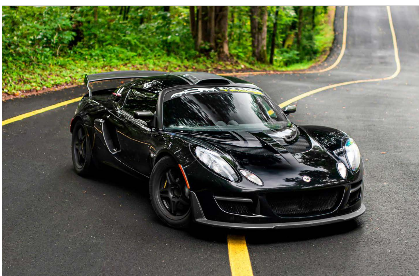
Backroad or nature area

An uncluttered background without other cars or people.