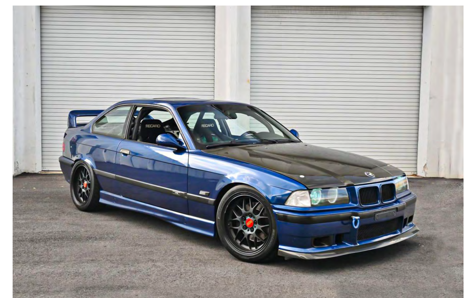
Empty industrial parking lot