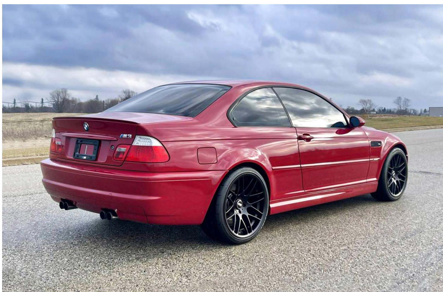
Overcast or cloudy skies work well

An uncluttered background without other cars or people.