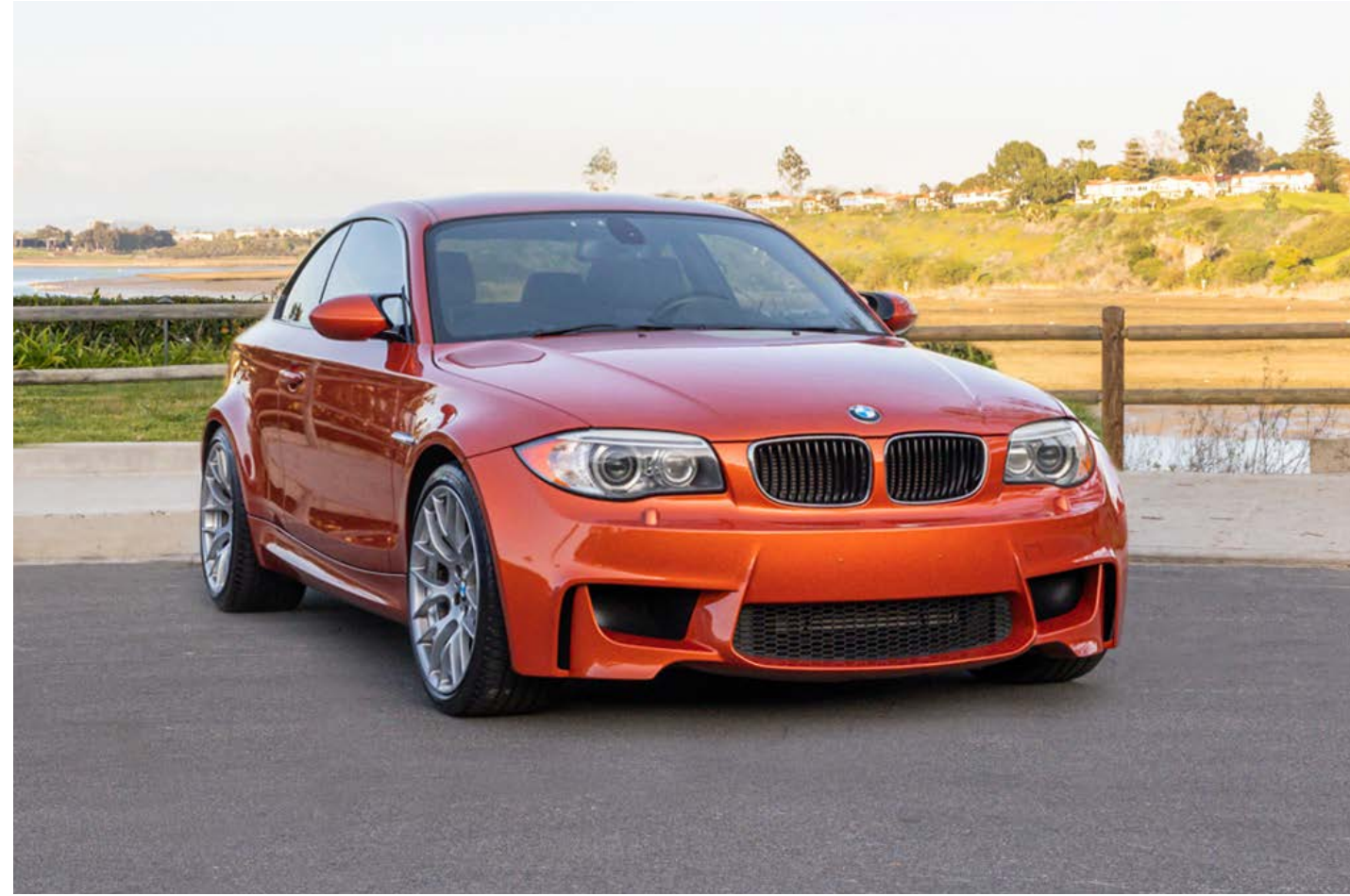
Passenger front quarter