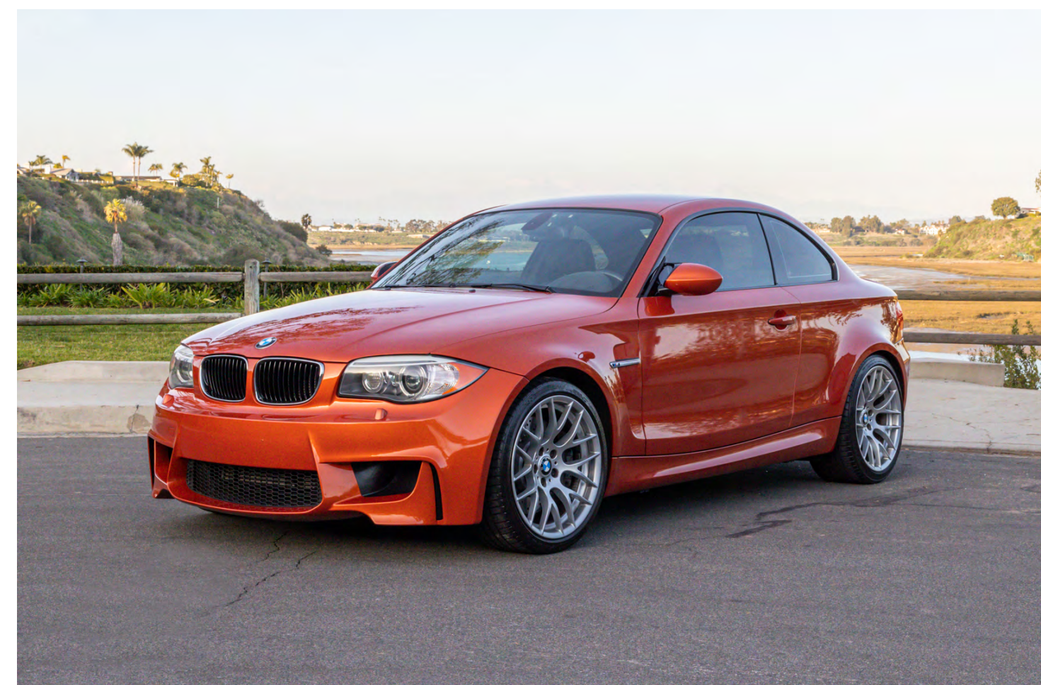
All photos should be taken in horizontal (landscape) orientation

Upload high resolution images, ideally with a 3:2 aspect ratio.