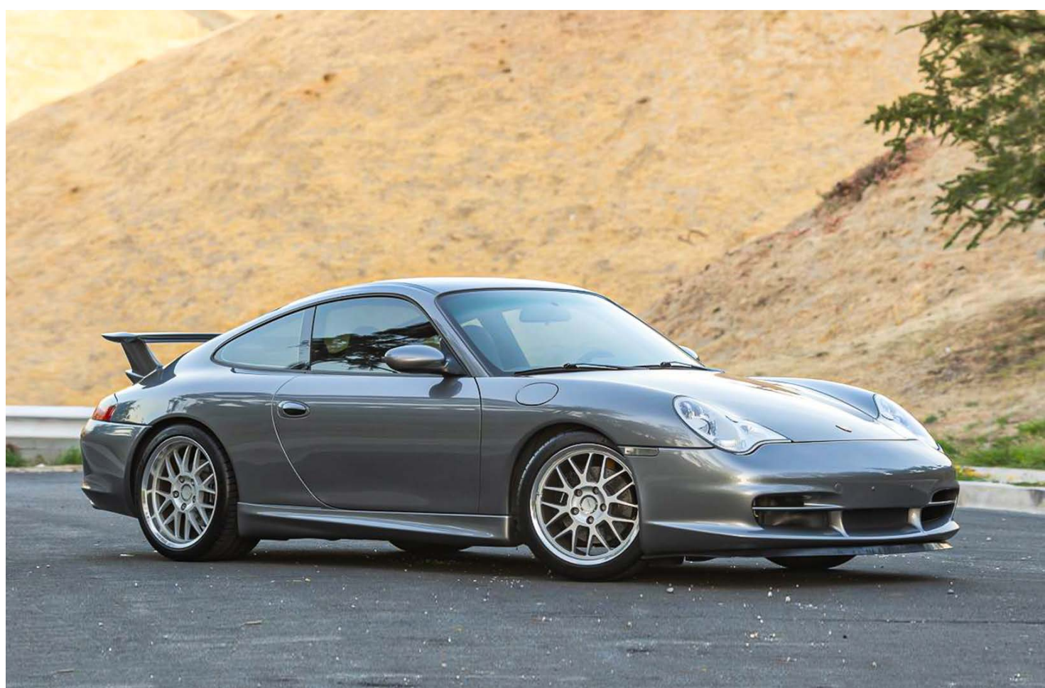
If shooting in the middle of the day, use open shade