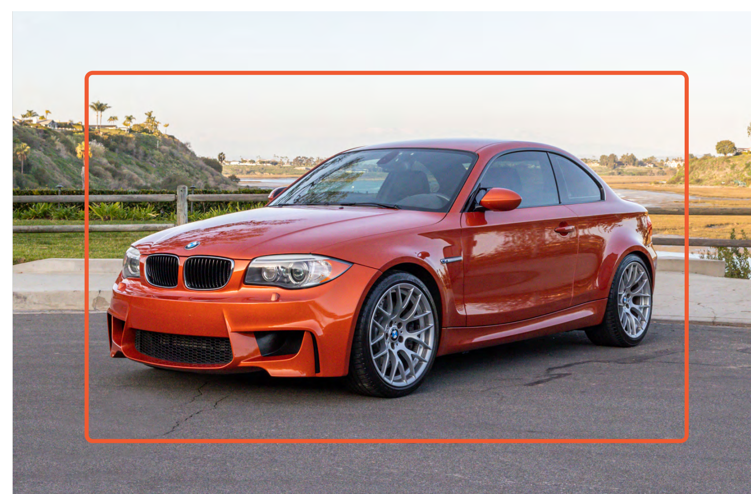
You should be about 15 feet away

The car should only take up 75% of the photo.