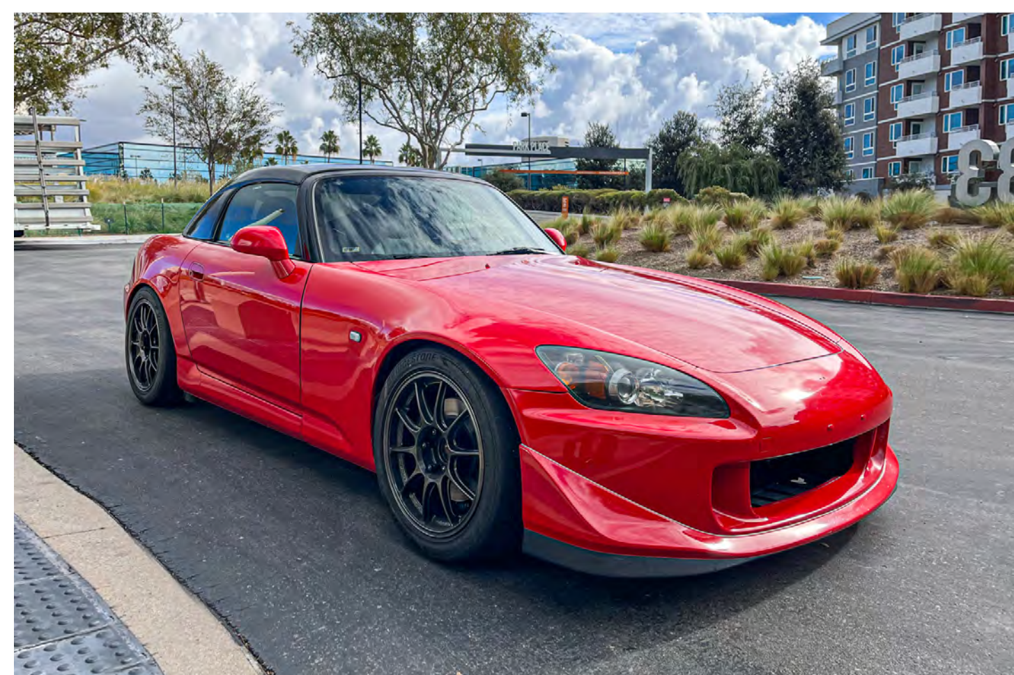
Side street or park