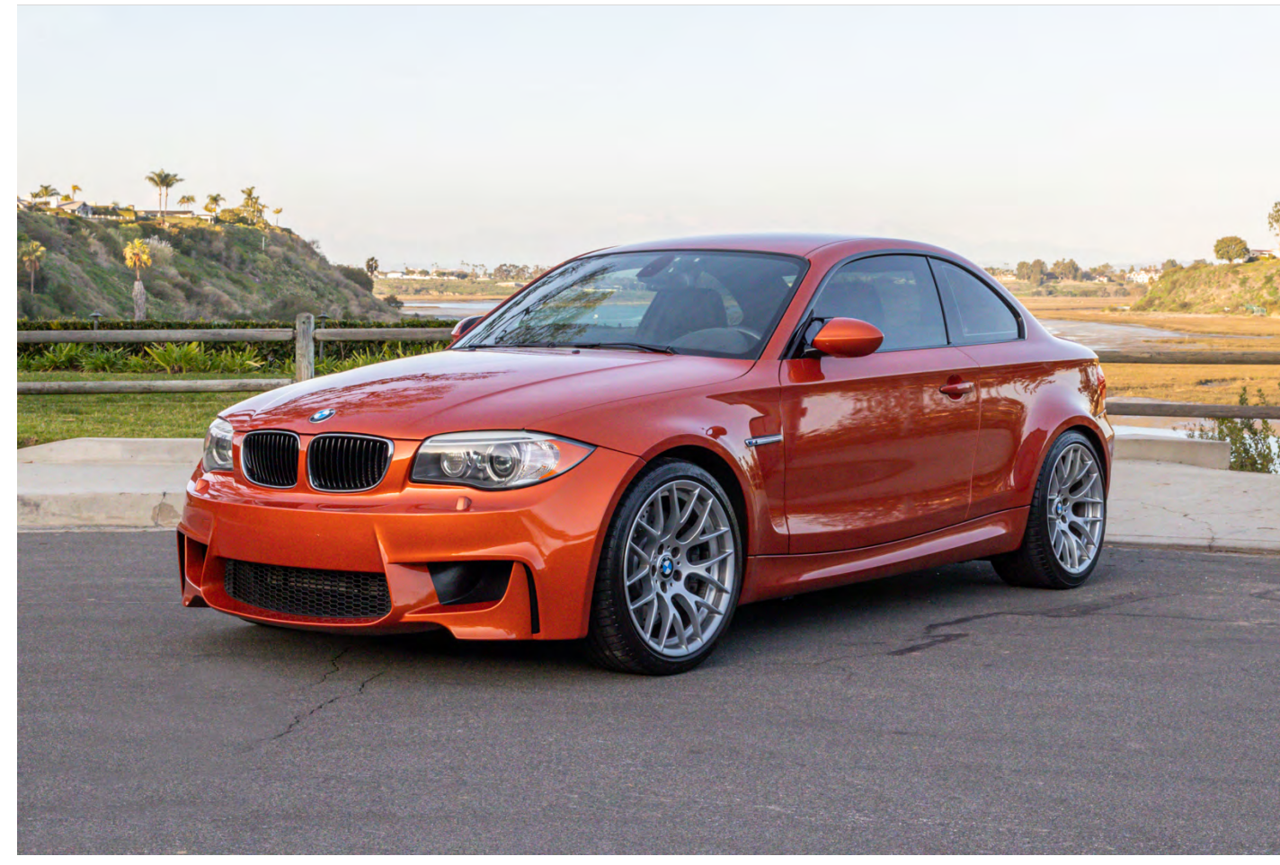
Driver front quarter