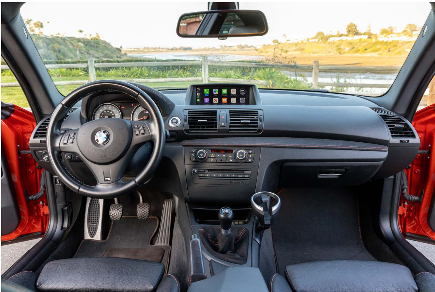
Entire dash from rear seat