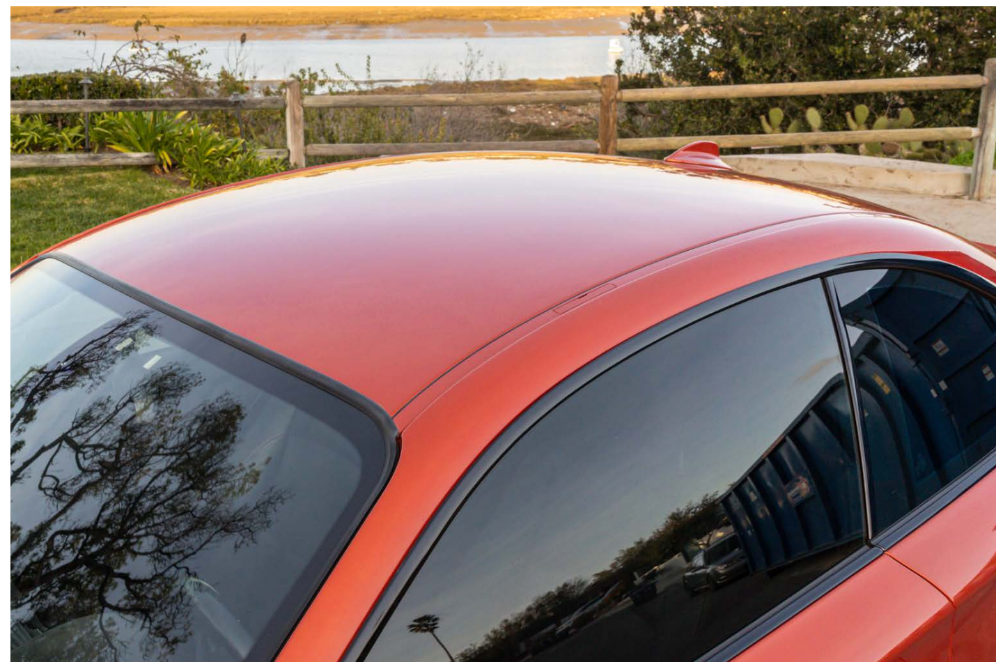
Roof and hood