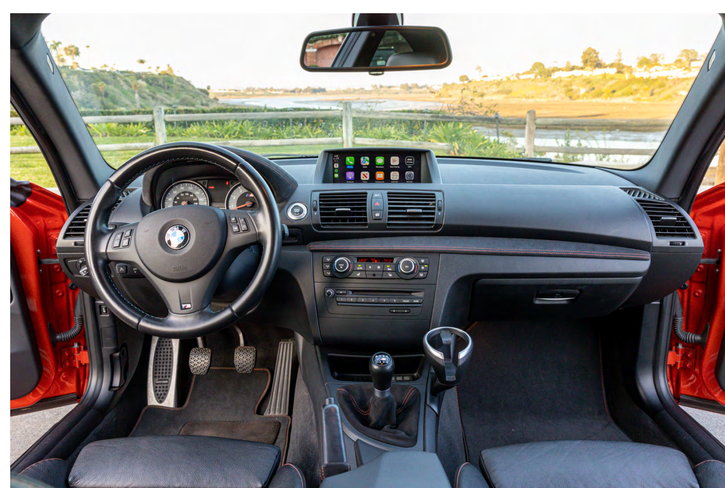
Entire dash from rear seat