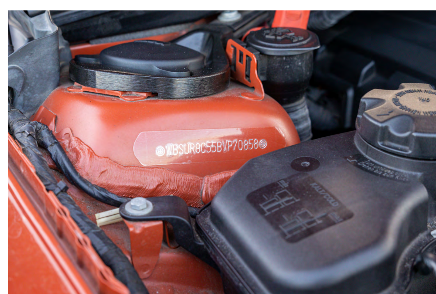
VIN, stamps, or markings