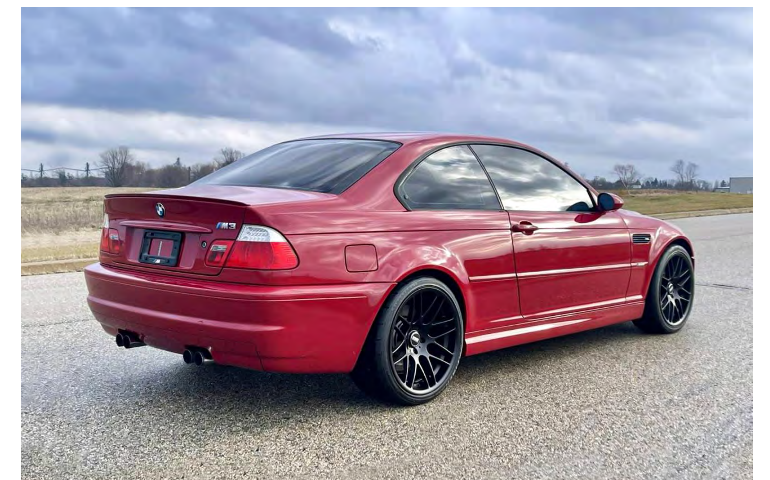
Overcast or cloudy skies work well