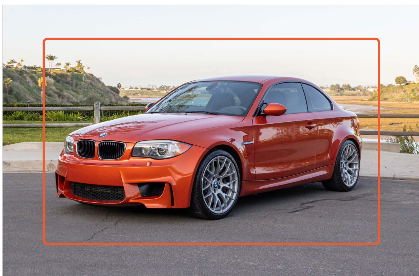
You should be about 15 feet away

The car should only take up 75% of the photo.