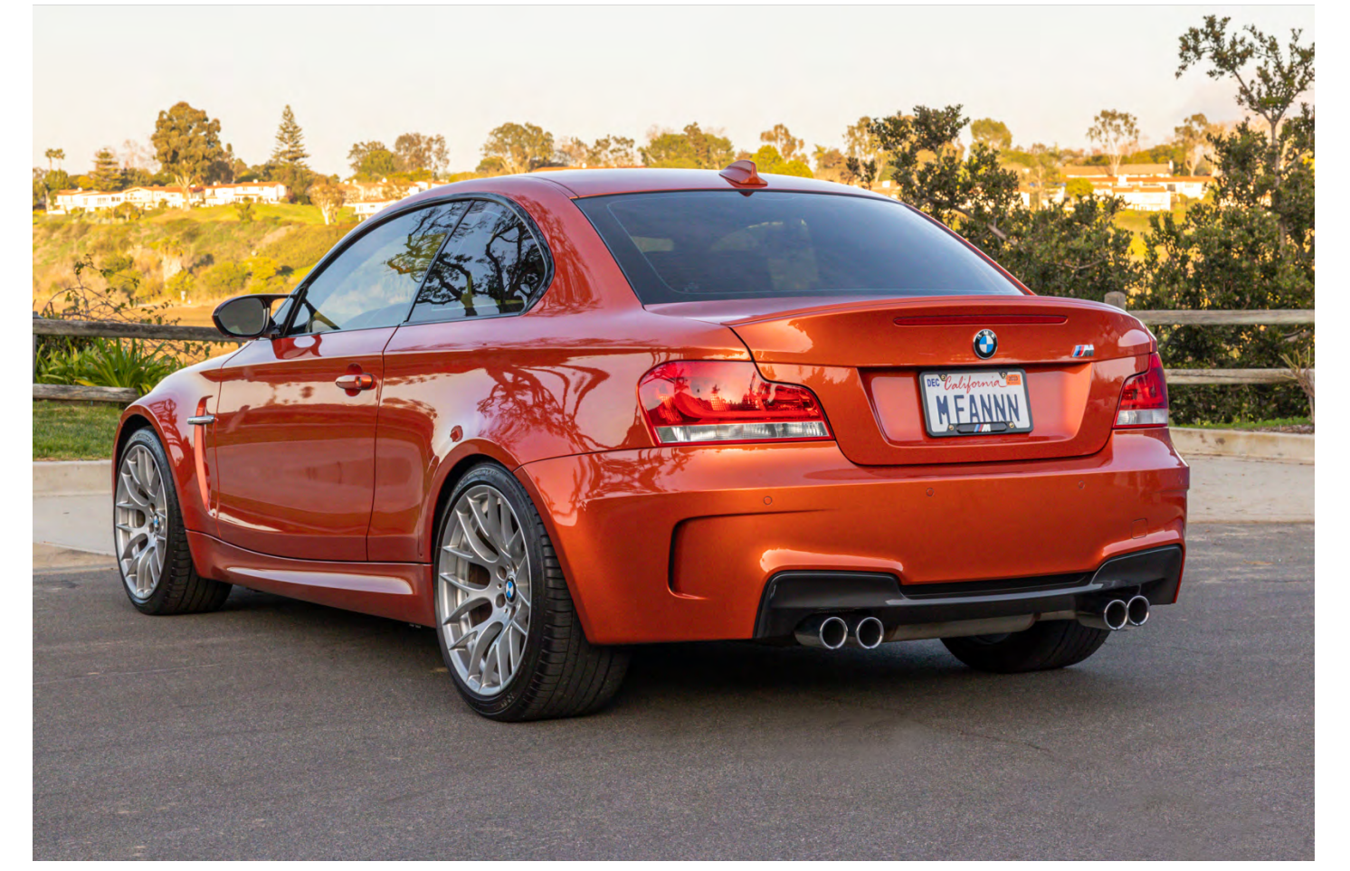
Driver rear quarter