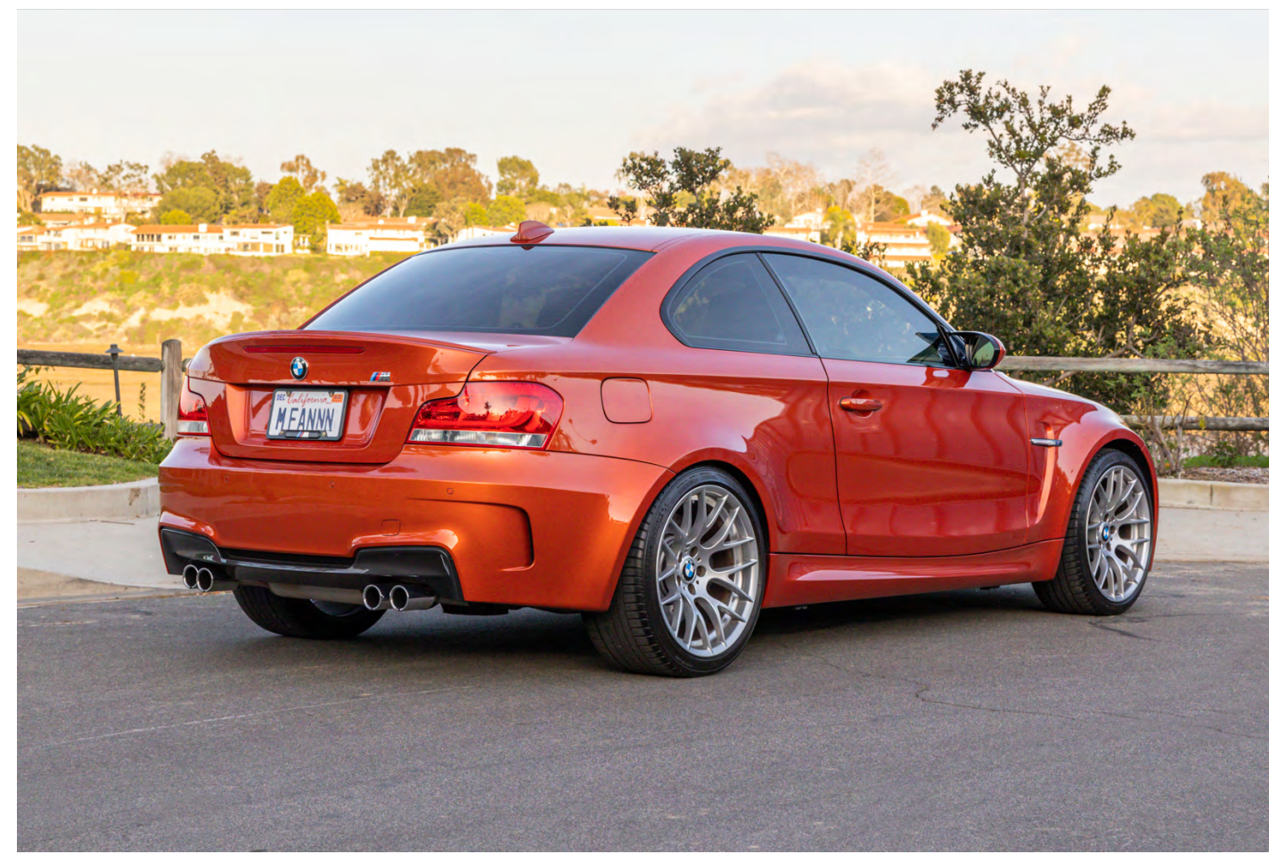
Passenger rear quarter