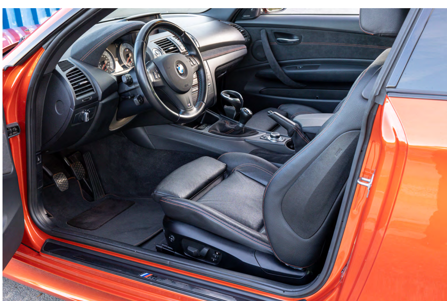
Wide view from driver side