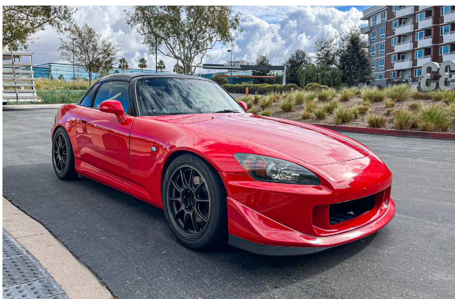
Side street or park