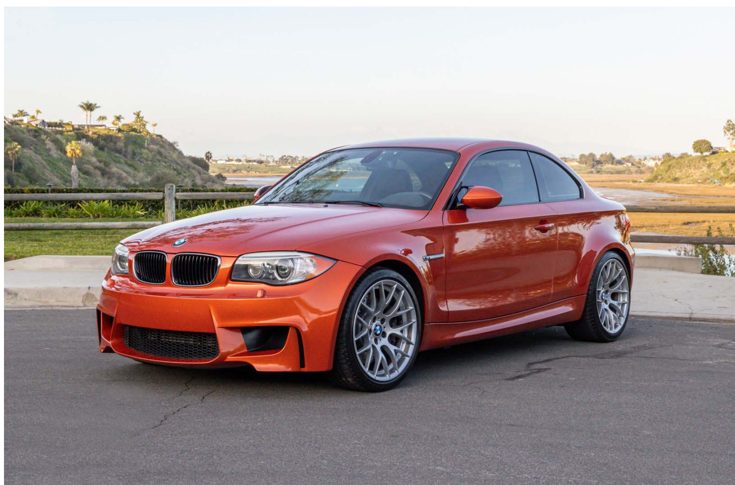
All photos should be taken in horizontal (landscape) orientation

Upload high resolution images, ideally with a 3:2 aspect ratio.