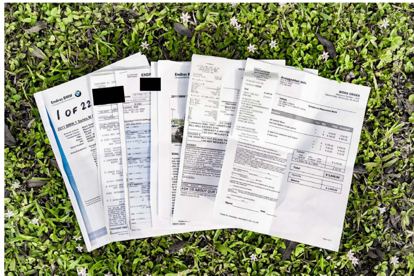
Service records or dyno charts