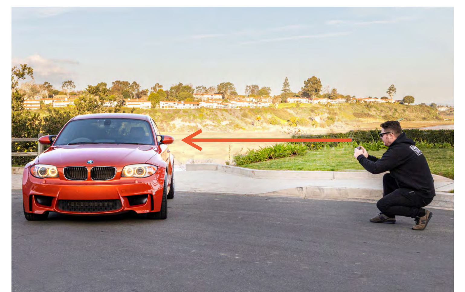
Squat down or bend a knee

Keep your camera level with the side mirrors.