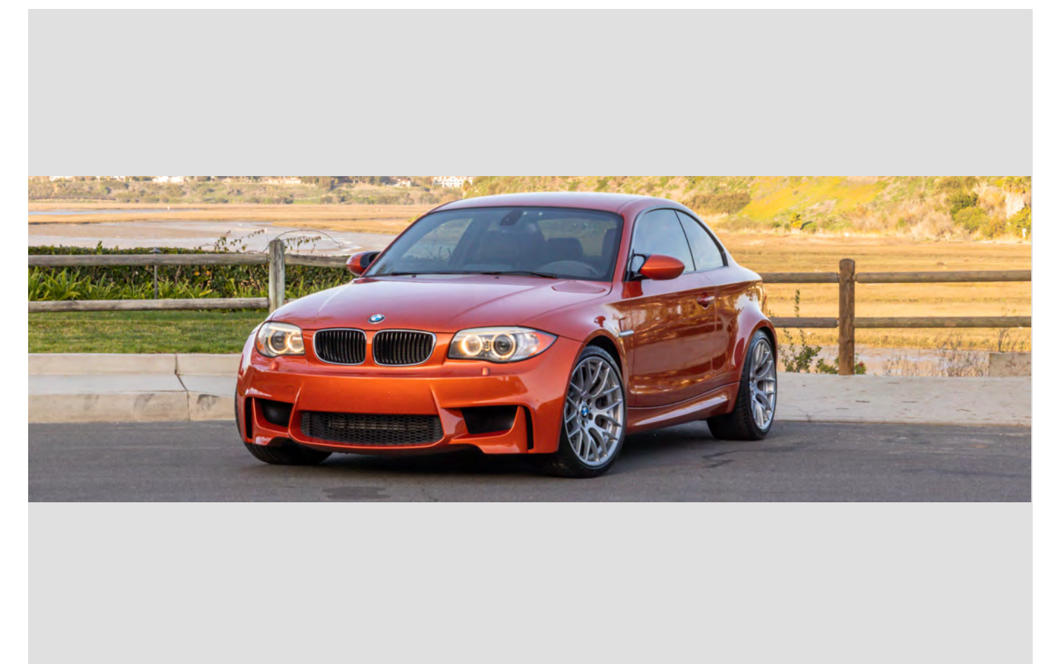
🚫 Don't use extra wide photo settings