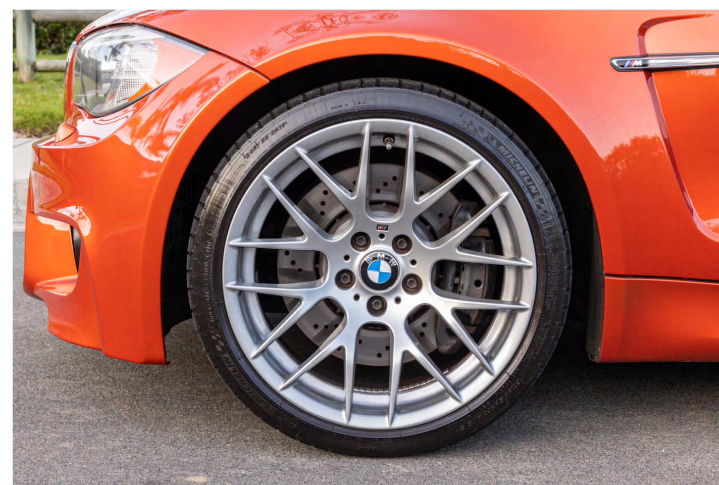
Wheels and tires