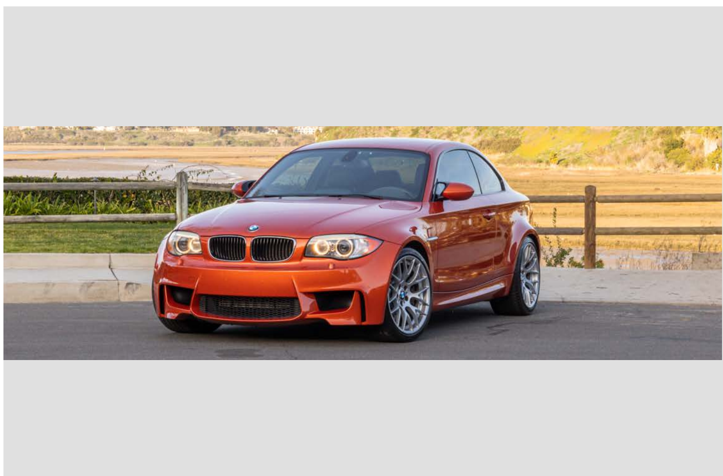
👉 Don't use extra wide photo settings

Proper lighting reduces sun glare and harsh shadows.