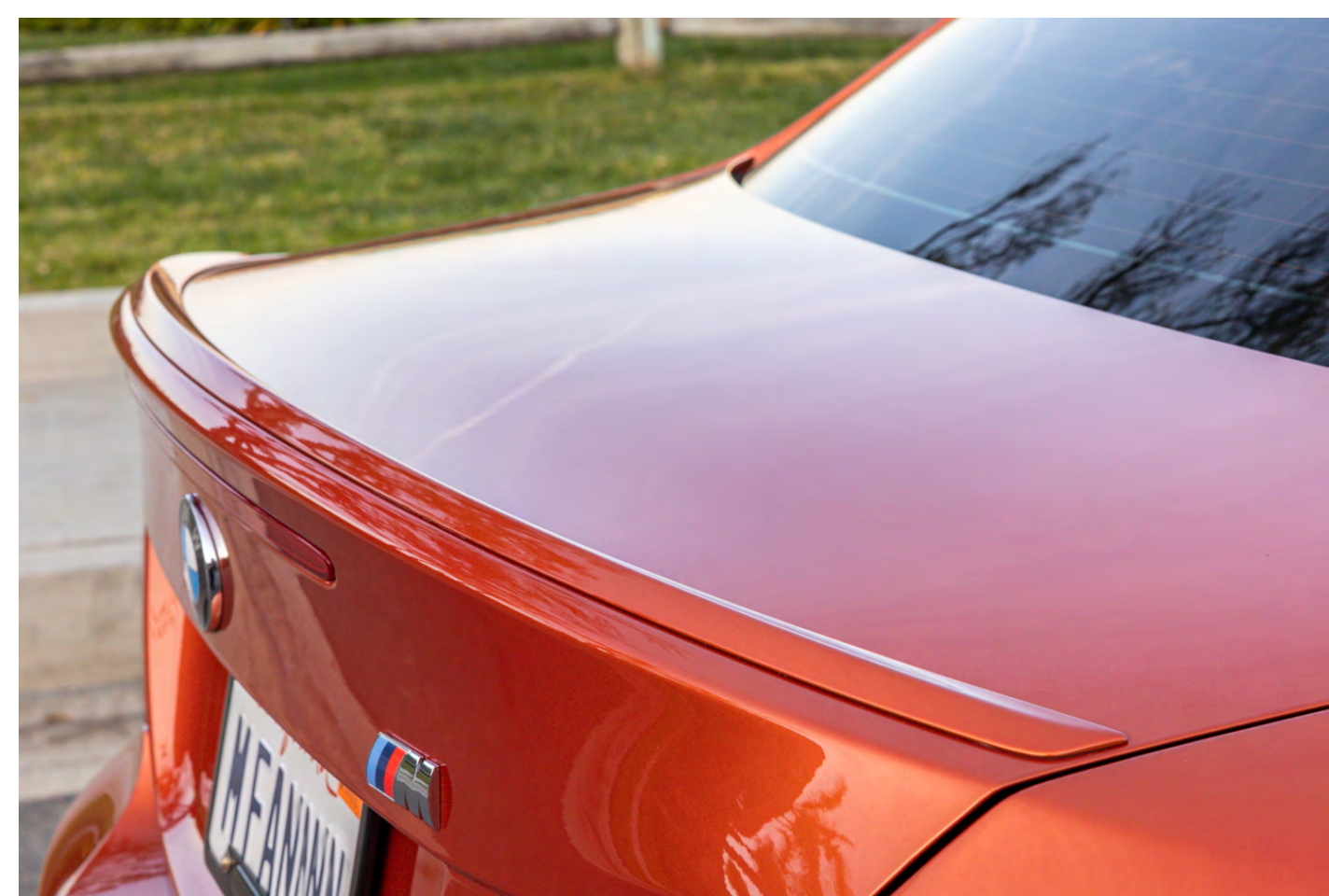
Wing, diffusers, or front lip