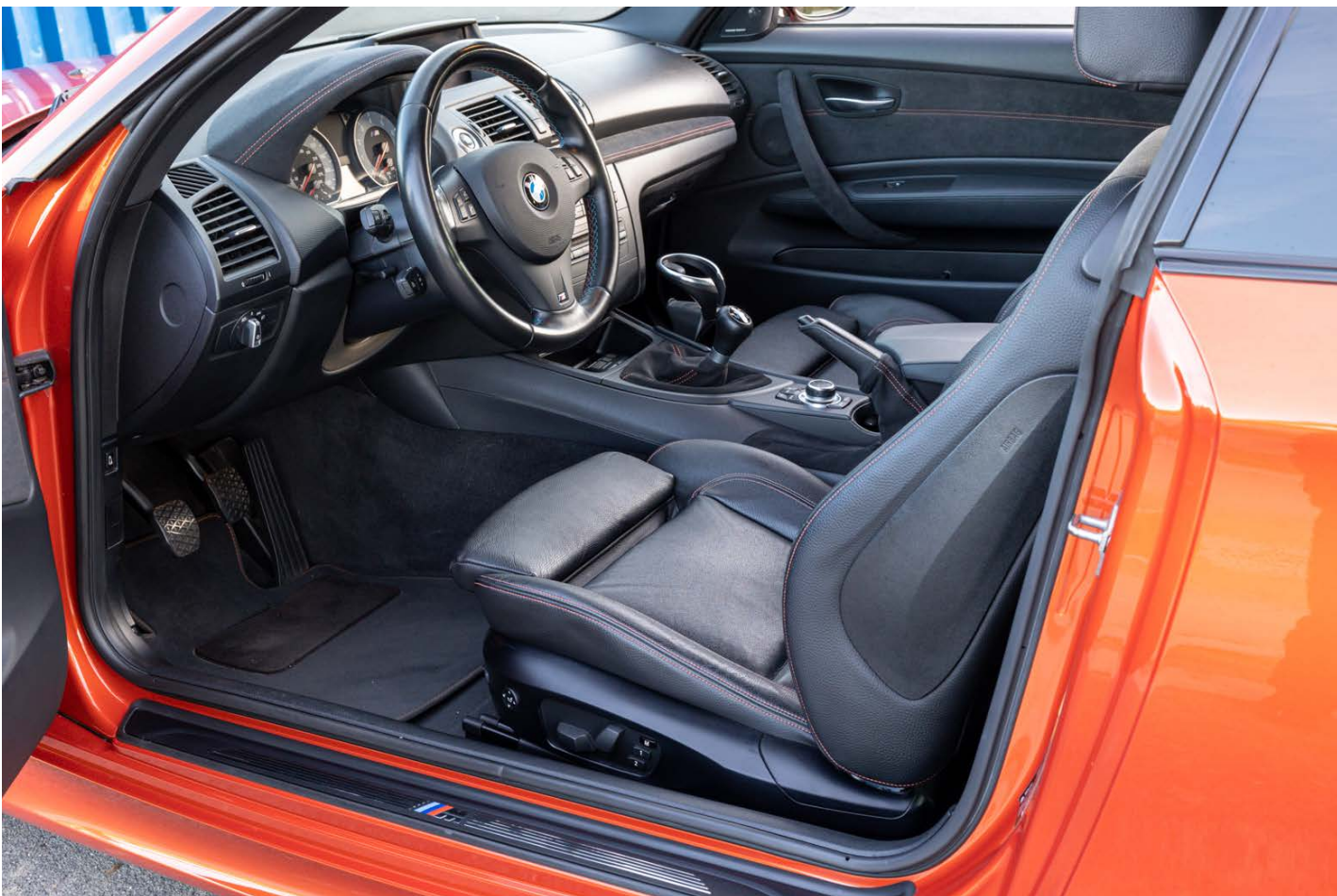
Wide view from driver side

Capture the interior and any signs of wear.