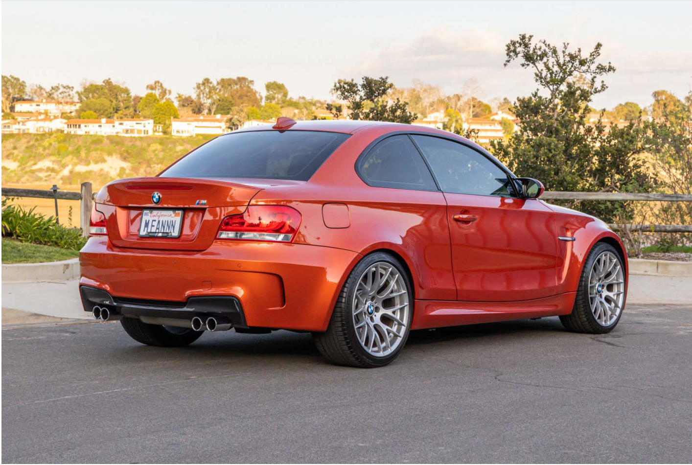
Passenger rear quarter