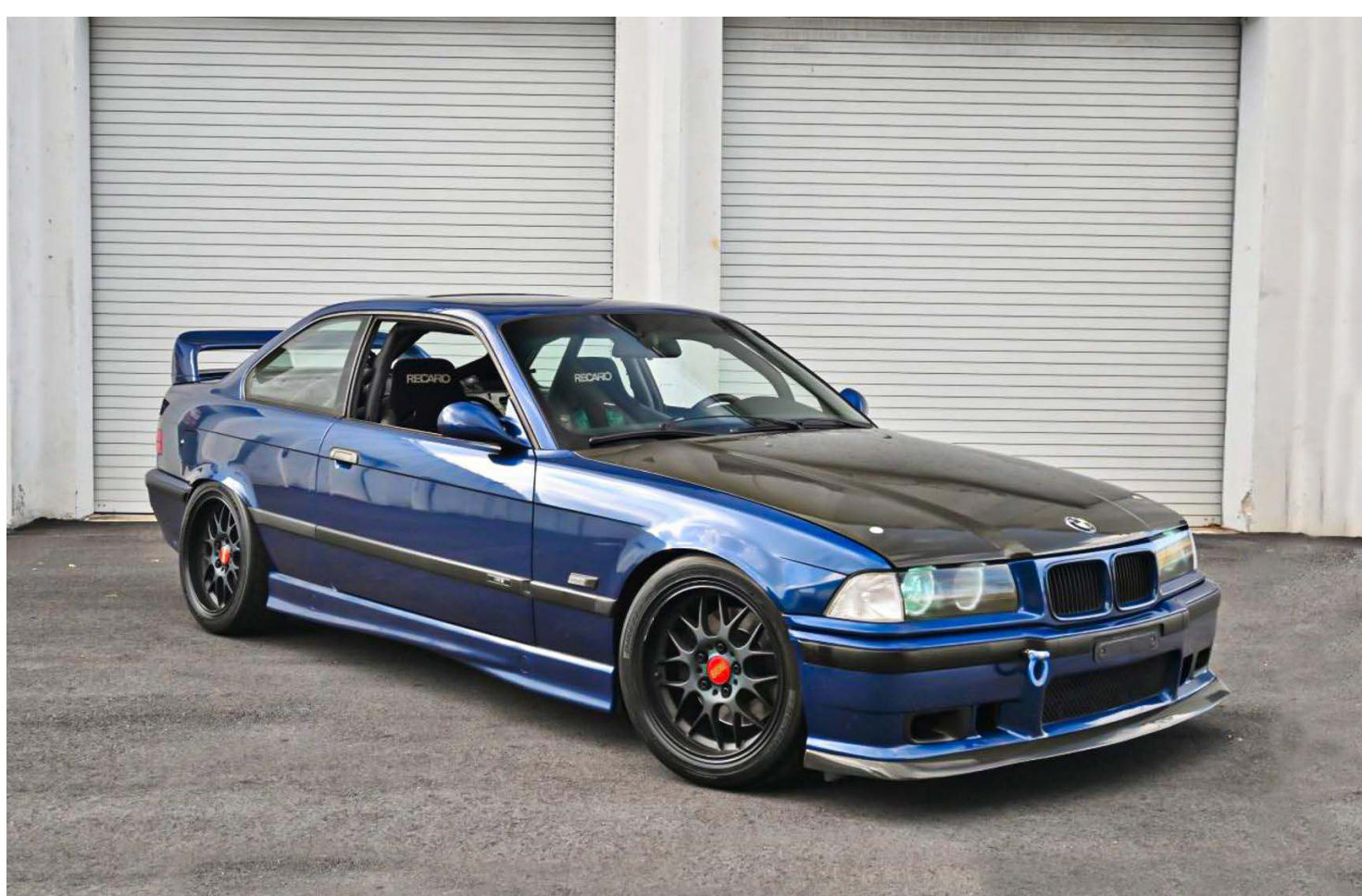
Empty industrial parking lot

The car should only take up 75% of the photo.