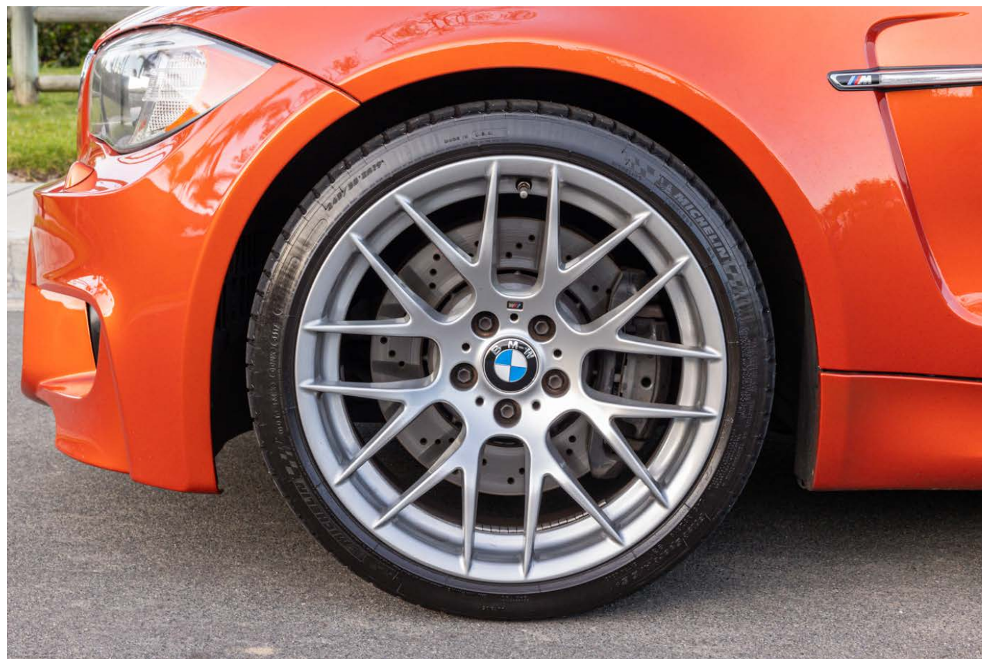
Wheels and tires