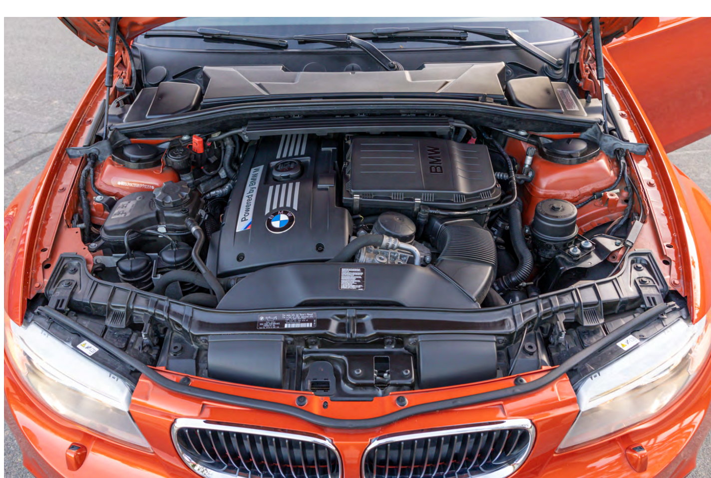
Entire engine bay from above