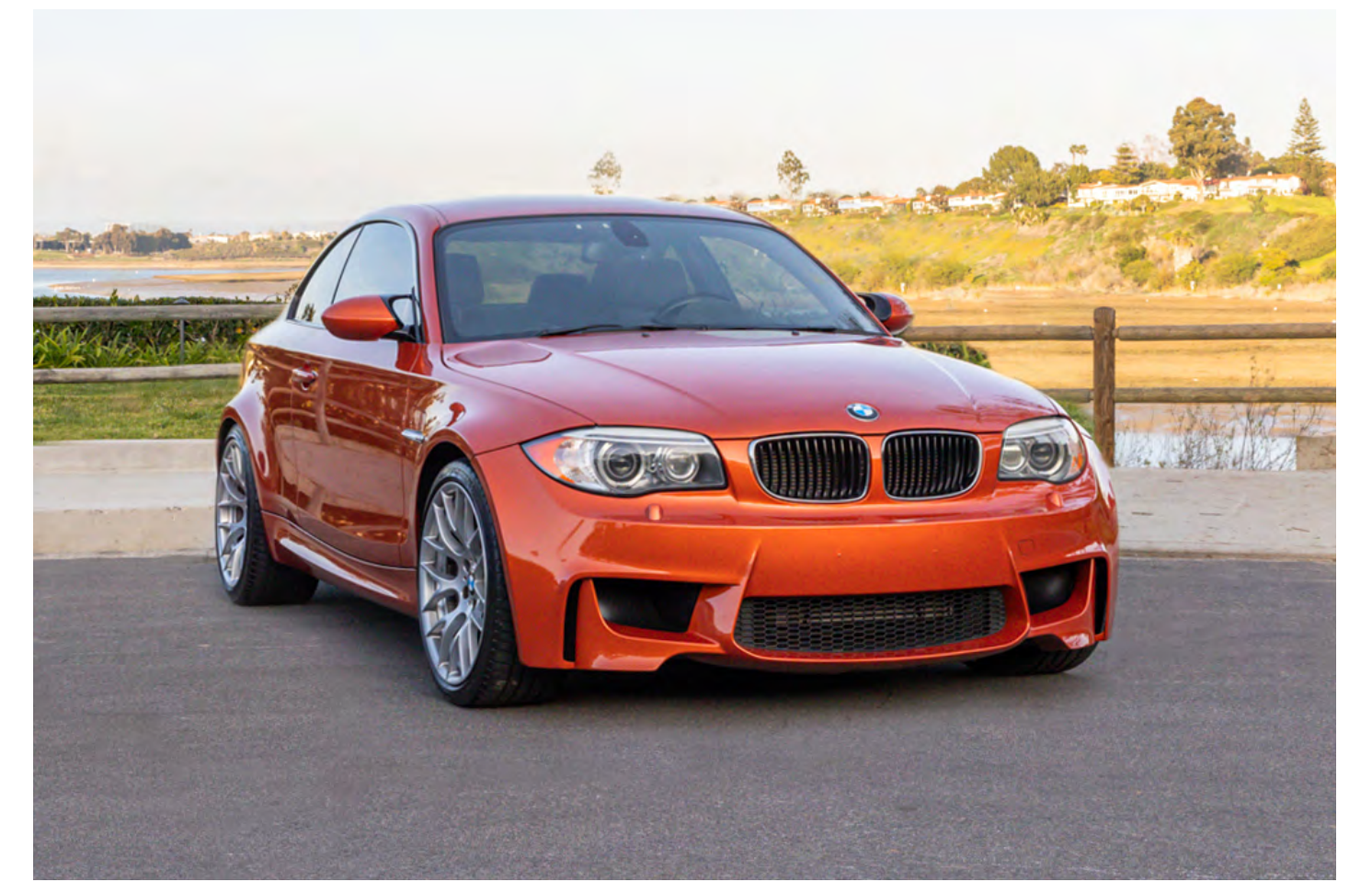
Passenger front quarter